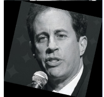
Pictured from top to bottom: Condoleezza Rice, Patrick Lencioni, Tom Brokaw, Jerry Seinfeld